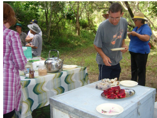
Afternoon Tea—Red Dragon Fruit, Jack Fruit, Seeds, & Chinese peanuts