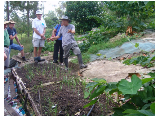
The Garlic Patch