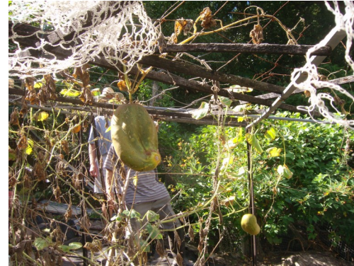
The Giant Cucumber